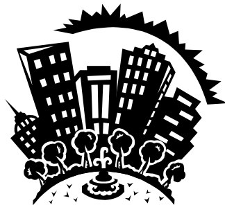
Are We There Yet?

The full version of Are We There Yet can be found on the Protowrxs films web site at http://Protowrxs.Brickfilms.com .