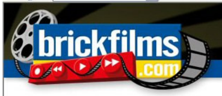
Brickfilms.com—THE home of animated bricks...