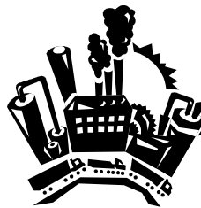
Brickville City Council—A laugh every agenda item

Between the pure greed, the confusion, and the snoring, very little business actually took place.. As usual.